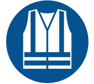
WEAR HIGH VISIBILITY CLOTHING IN MULTI-VEHICLE AREAS